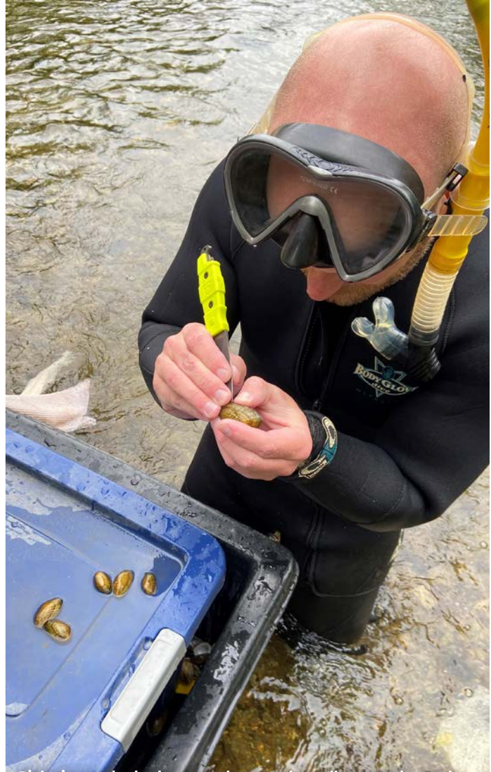
Biologist gently checks opens the mussel to collect a swab sample.