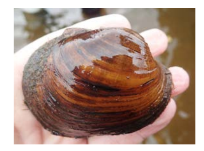
Left: Canary Kingshell.

Top: Higgins Eye (Lampsilis higginsii).