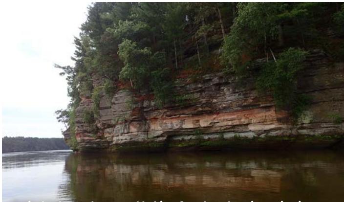
Typical Salamander Mussel habitat found on the Wisconsin River.

1. Increased Protections: The federal listing will