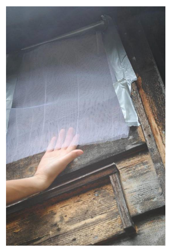
Space on bottom for bats to escape

Remember that bats will not chew their way back inside your house. So, after