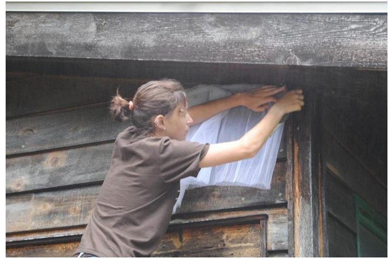
Applying screen for one-way door

One-way exclusion devices can be created using plastic netting with one-sixth inch (0.4 centimeter) or smaller mesh. Shape the plastic netting so that it covers the opening entirely and extends at least two feet below it. Using staples or duct tape, attach the top and side edges of the